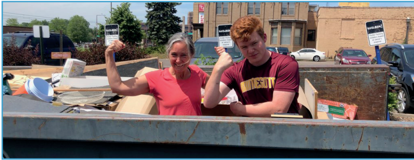
Shedding the weight of 2020 by clearing out our offices.